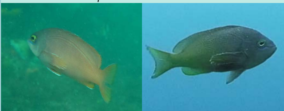
Barber Perch Caesioperca rasor