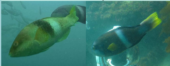
Blue Throat Wrasse Notolabrus tetricus