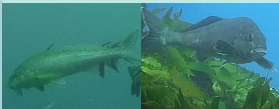
Dusky Morwong Dactylophora nigricans