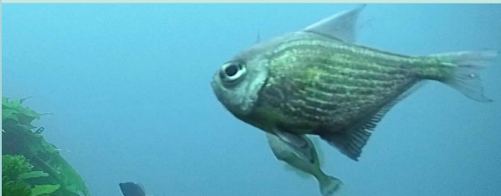
Bigscale bullseye Pempheris multiradiata