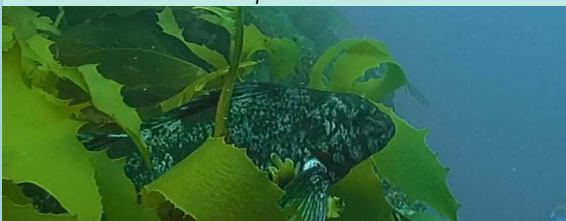
Marble Fish Aplodactylus arctidens