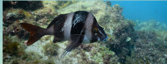
Magpie Perch Cheilodactylus nigripes