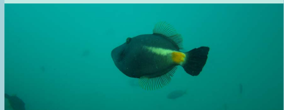
Yellow-striped Leatherjacket Meuschenia flavolineata