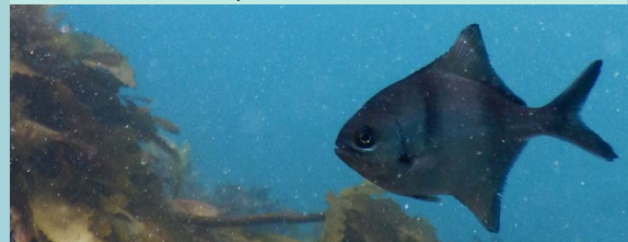
Sea Sweep Scorpus aequipinnis