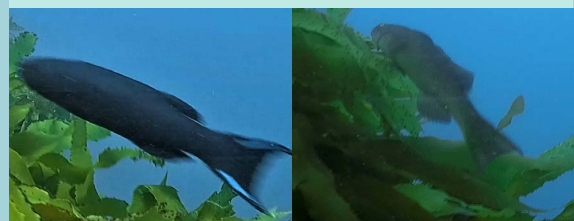
Herring Cale Olisthops cyanomelas