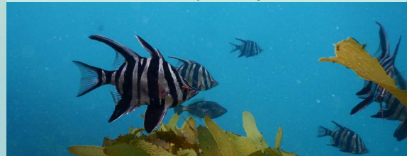
Old Wife Enoplosus armatus