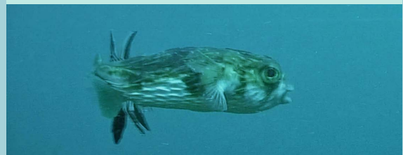
Globefish Diodon nictemerus