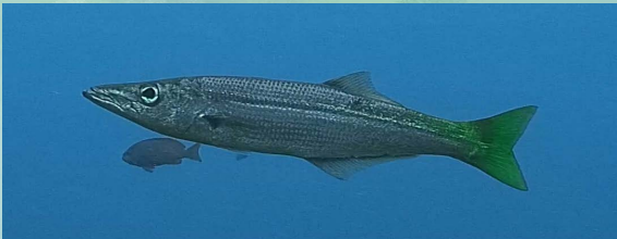
Longfin pike Dinolestes lewini