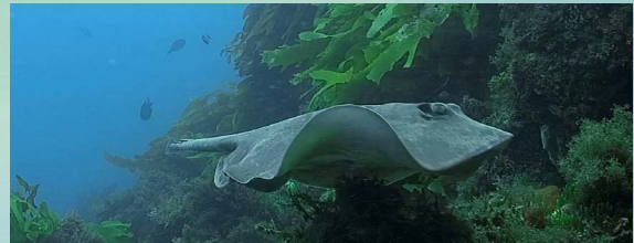
Eastern Shovel-nosed Stingray Trygonoptera imitata