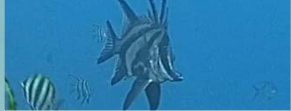
Long Snouted Boarfish Pentaceropsis recurvirostris