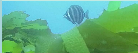
Moonlighter Tilodon sexfasciatus