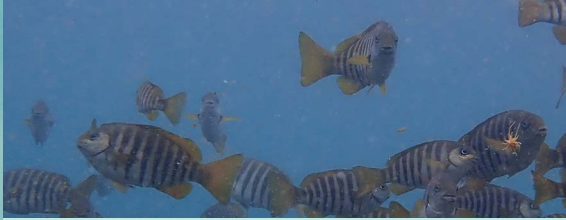
Zebra Fish Girella zebra