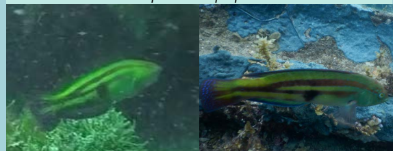
Senator Wrasse Pictilabrus laticlavius