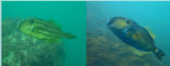
Six Spined Leatherjacket Meuschenia freycineti