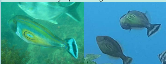
Horseshoe Leatherjacket Meuschenia hippocrepis