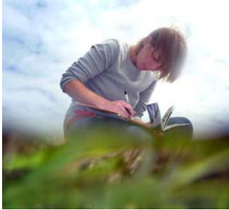
A MCPC member carrying out an Intertidal Survey